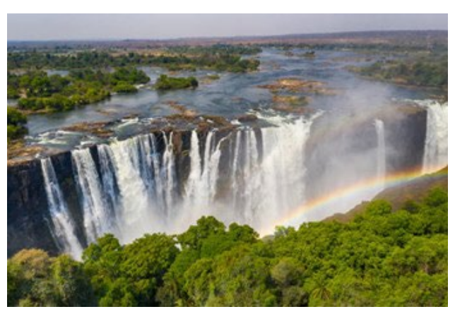
7 - Sika Class – Zimbabwe today - Tourism at Victoria Falls