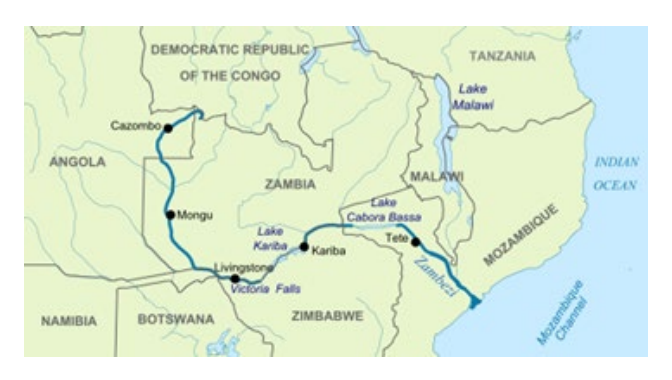
5 - Muntjac Class – The History of the Zambezi and The Great Zimbabwe