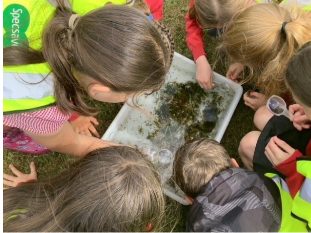
4 - On closer inspection.