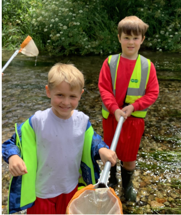
2 - Look what we have found!