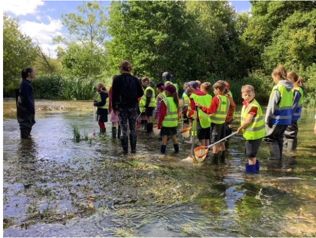
5 - Getting in the river to take a closer look.

Back at school, the children continued with their River Day discussing their concerns for the protection of all our rivers, waterways and seas. Our younger children made models of the River Kennet and carried out scientific experiments, making dirty water "clean" by filtering using different materials. Others created posters and wrote letters which we are going to send to those in charge of looking after our precious river, Thames Water. We can't wait for their response!