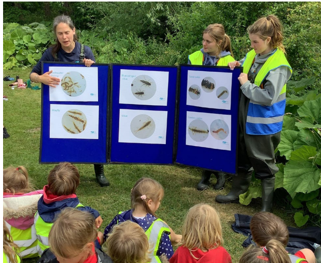
3 - Did you know...?